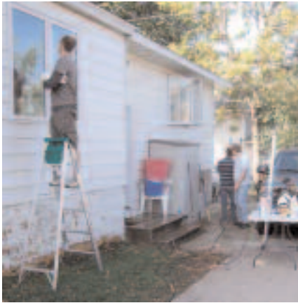
Washing windows and siding.