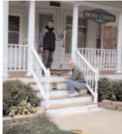
Painting the front steps.